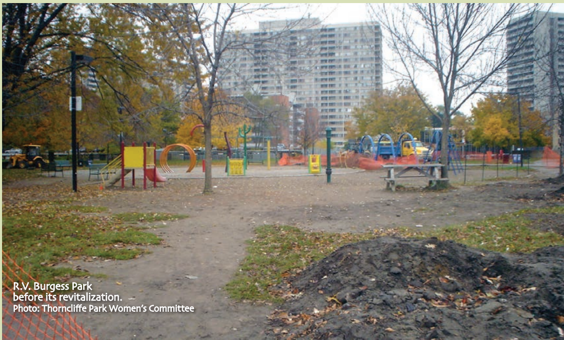
R.V. Burgess Park before its revitalization.

More than a few bearing witness to these impressive achievements say the Women's Committee possesses "a secret sauce." This short chronicle will consider the ingredients that went into the Committee's unique and robust recipe for community development, including perseverance, a willingness to forge partnerships, and an immense commitment to volunteering.